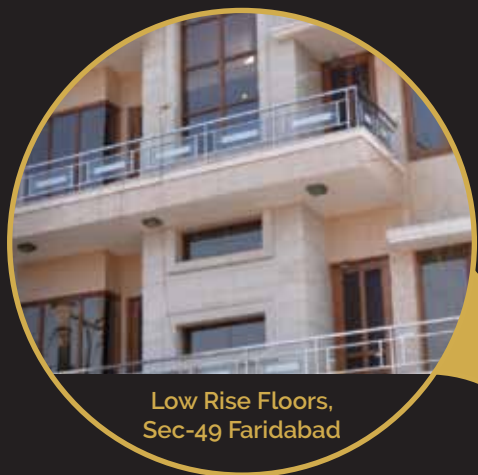
Low Rise Floors, Sec-49 Faridabad