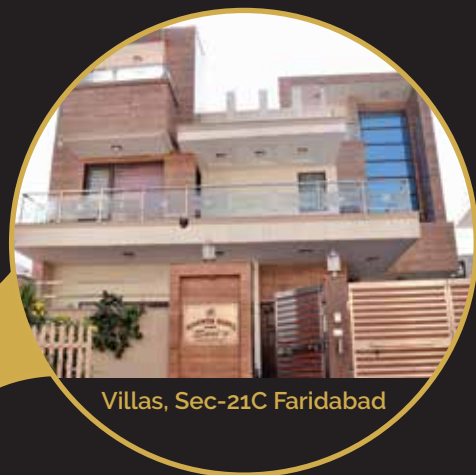
Villas, Sec-21C Faridabad