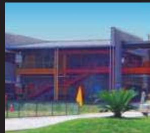
Shiv Nadar School