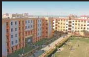
Lingaya's Institute of Management and Technology