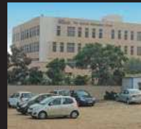
Sriram Millennium School