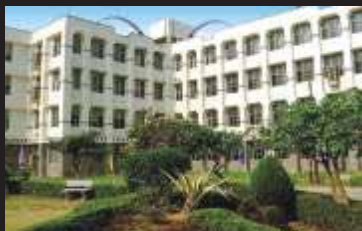
Sudha Rustagi Dental College

Renowned colleges like YMCA College of Engineering, CITM, Manav Rachna International University, Lingaya's University, Institute of Management & Technology, and newly developed medical & dental colleges, all within 5 minutes.