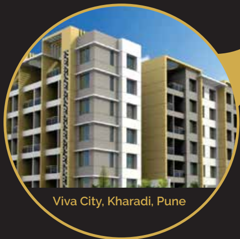
Viva City, Kharadi, Pune