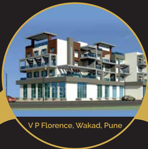
V P Florence, Wakad, Pune