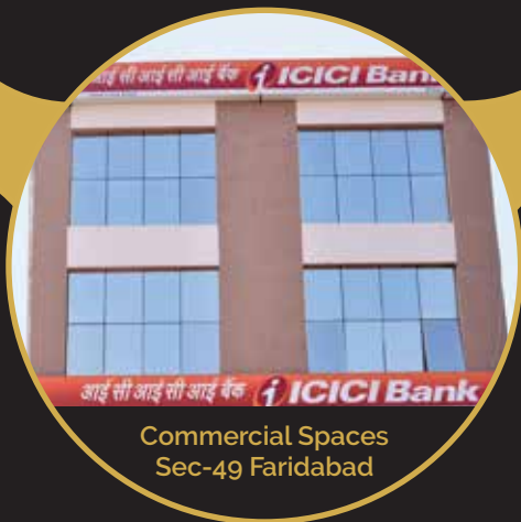
Commercial Spaces Sec-49 Faridabad