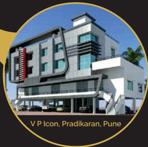
V P Icon, Pradikaran, Pune