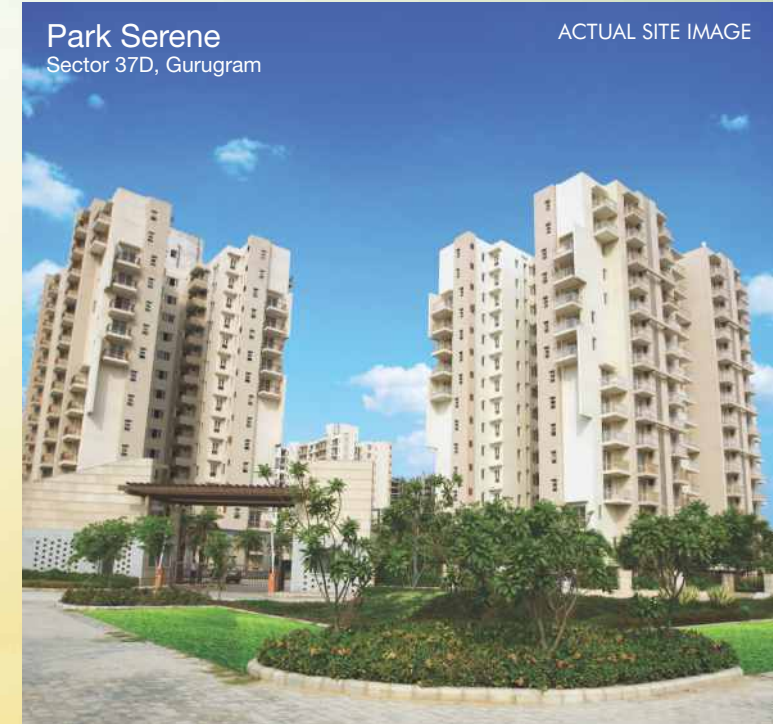
ACTUAL SITE IMAGE