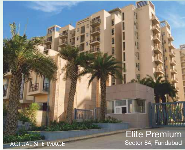
Elite Premium Sector 84, Faridabad