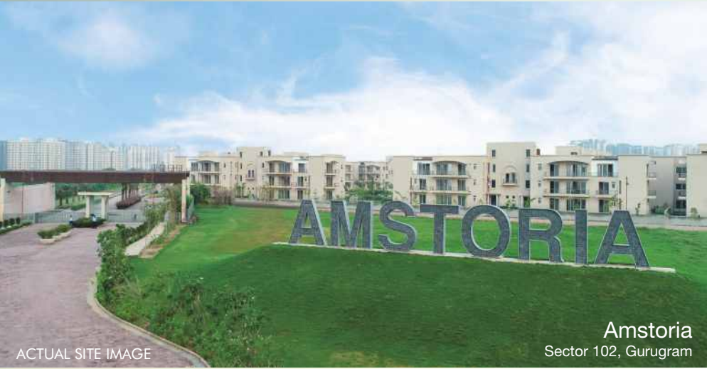
Amstoria Sector 102, Gurugram