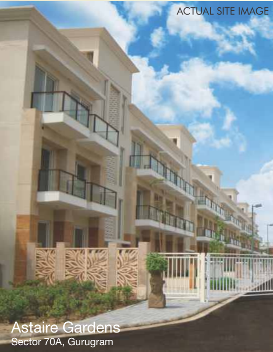
ACTUAL SITE IMAGE