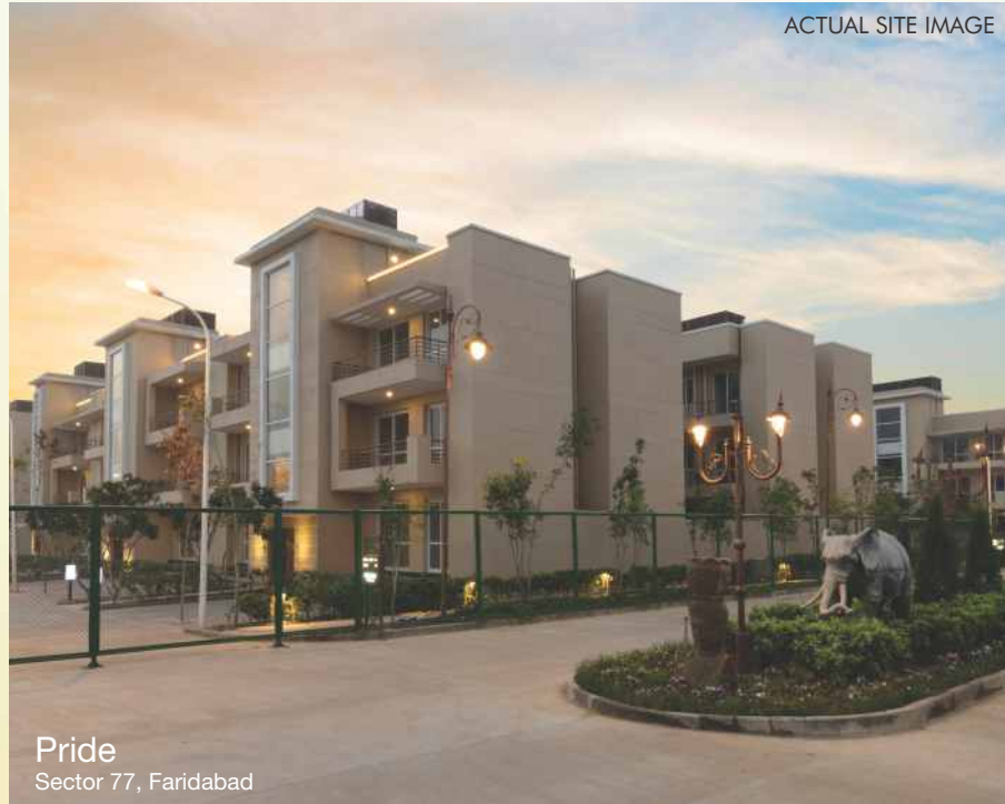
ACTUAL SITE IMAGE