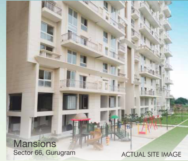
Mansions Sector 66, Gurugram